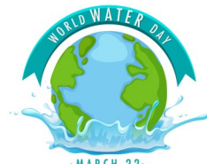
World Water Day, March 22