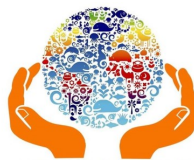
Creation Care Scripture