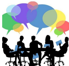
C3 Board Members